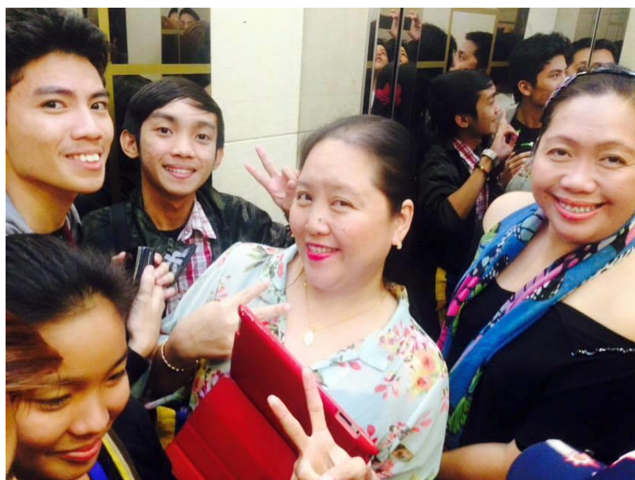
15 th Luzon-Wide Higher Education Press Conference last February 4-6, 2016 at the Hotel Felicidad St. Vigan City, Ilocos Sur