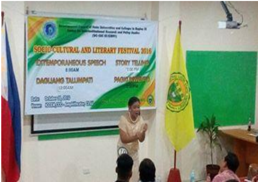
CIRPS 2016 held at the Central Luzon State University