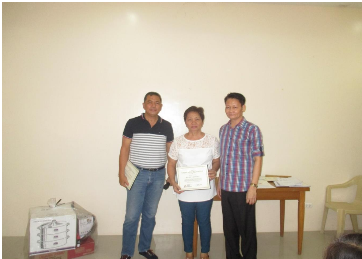
College of Education Faculty members with OWWA representative in the Food Processing