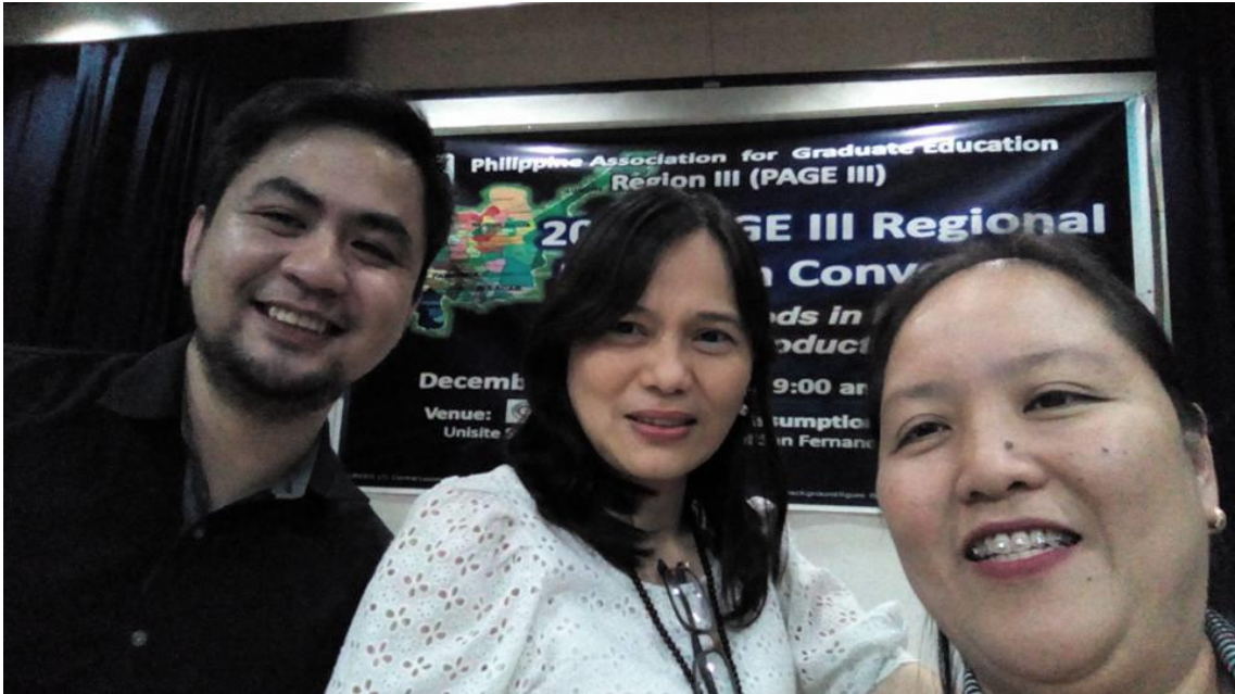
2016 PAGE III Regional Research Convention at the University of the Assumption last December 10, 2016.