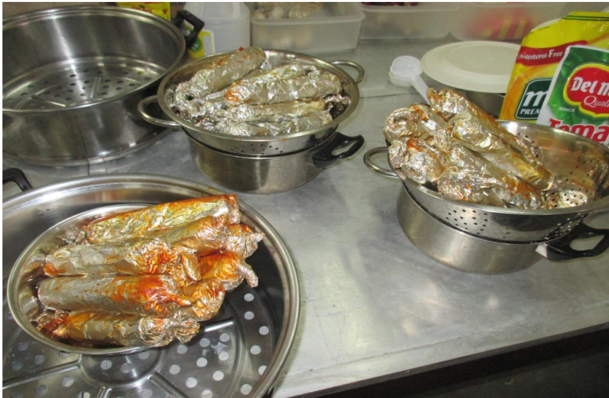
Projects of OWWA recipients: Embutido