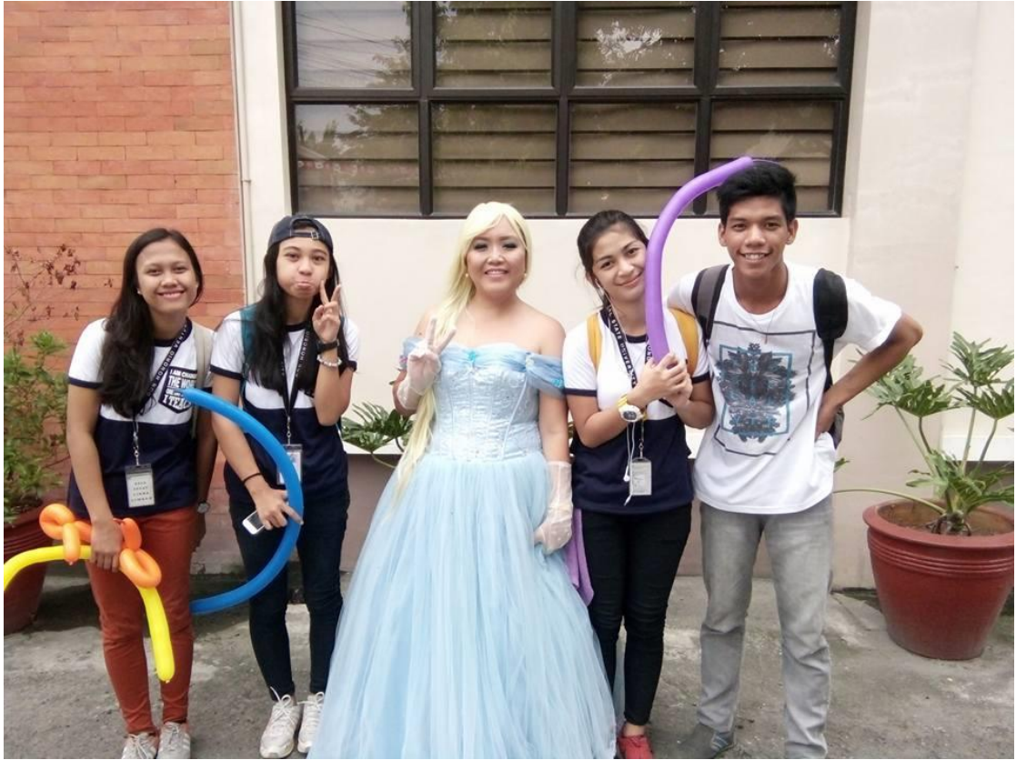
Lip Sync Battle Competition in the University Days last December 7-9, 2016