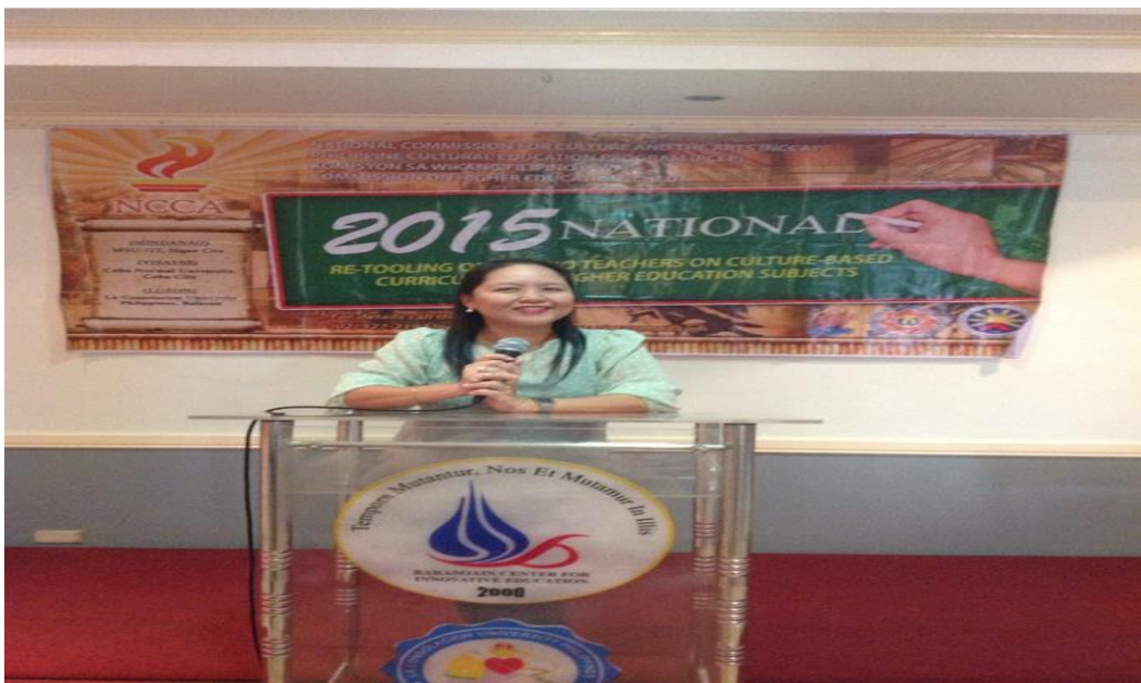
2015 National Re-Tooling of Filipino Teachers on Culture-Based Curriculum of Higher Education Subjects