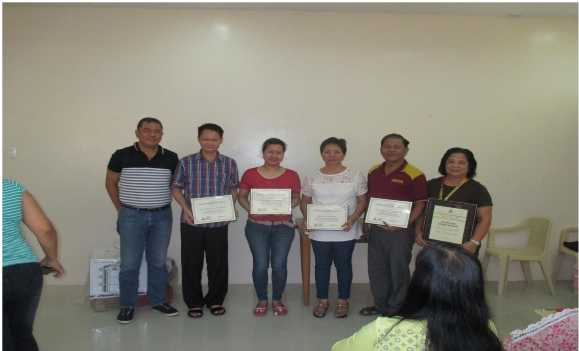
College of Education faculty members involved in the Extension Program