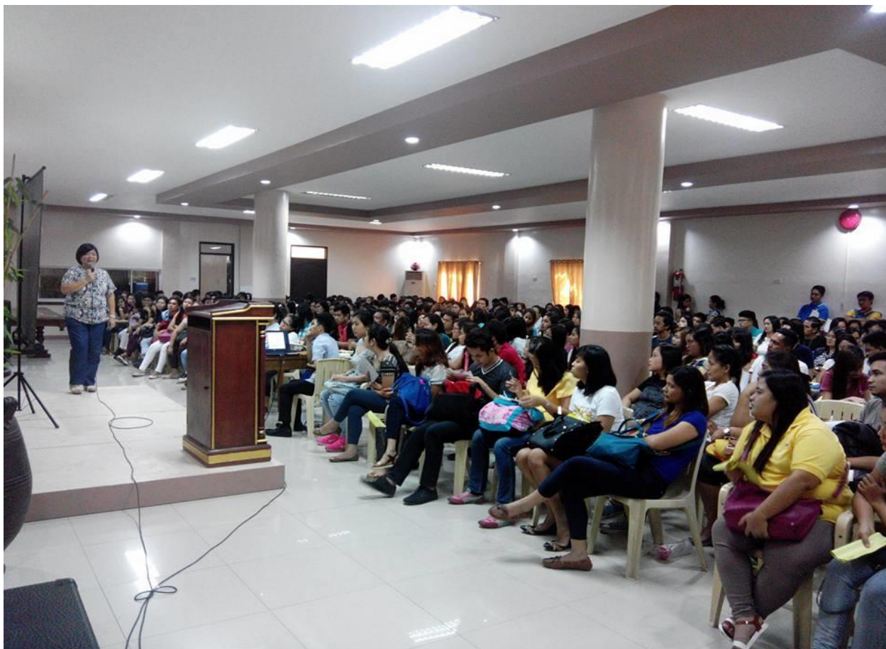
The attendees in the Final Coaching