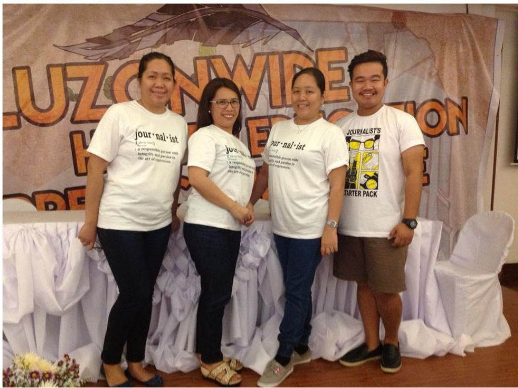
ANNUAL OSSEI Seminar-Workshop on School Publications last September 17-19, 2015 at the Legacy Crown Hotel Baguio City