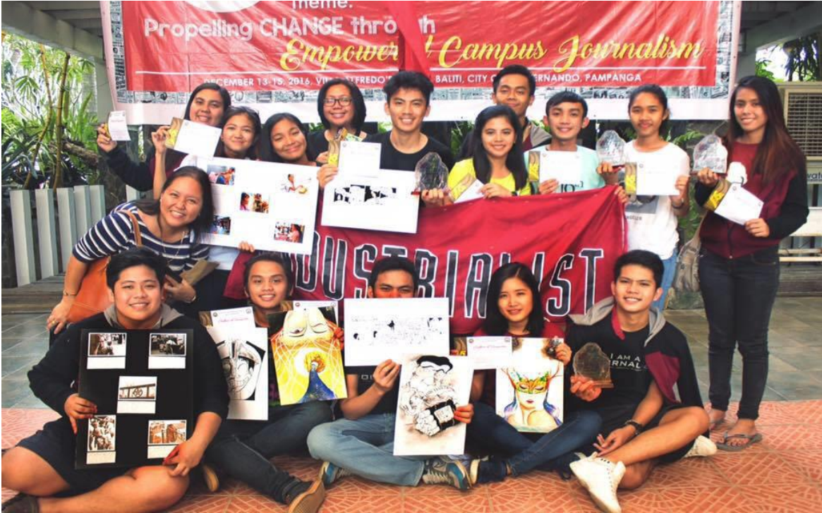
ATSPAR in 16 th Regional Higher Education Press Conference at Villa Alfredos, City of San Fernando last December 13-15, 2016.