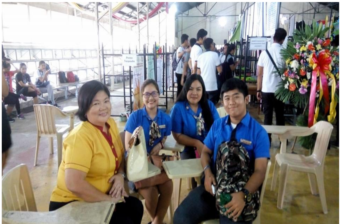
COE Students won 2 nd Place in University Quiz Bee