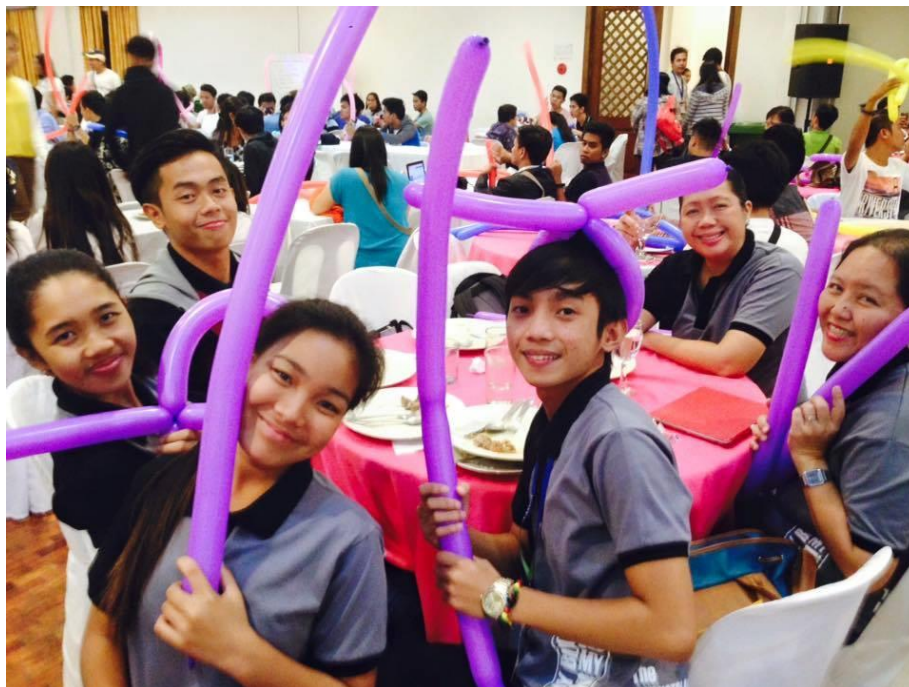
15 th Luzon-Wide Higher Education Press Conference last February 4-6, 2016 at the Hotel Felicidad St. Vigan City, Ilocos Sur