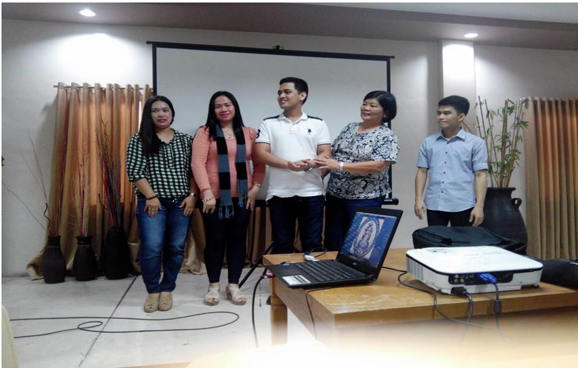
COE Faculty attend the LET Final Coaching