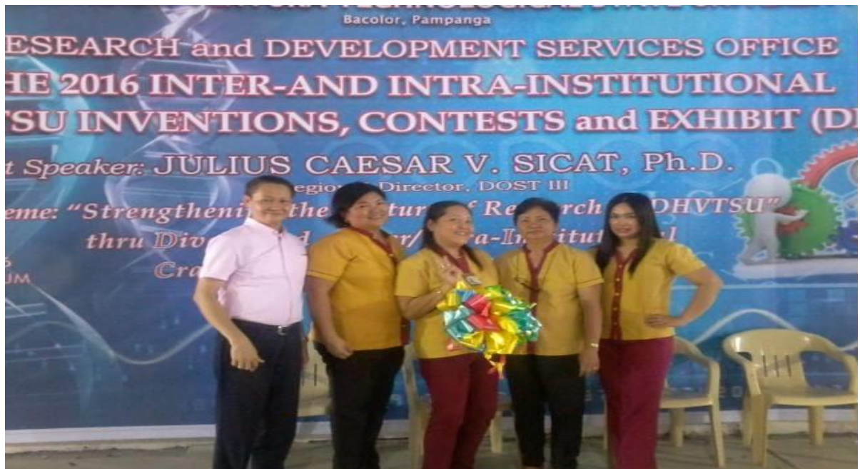
COE received awards in DICE 2016 MOST RESEARCH-ORIENTED UNIT