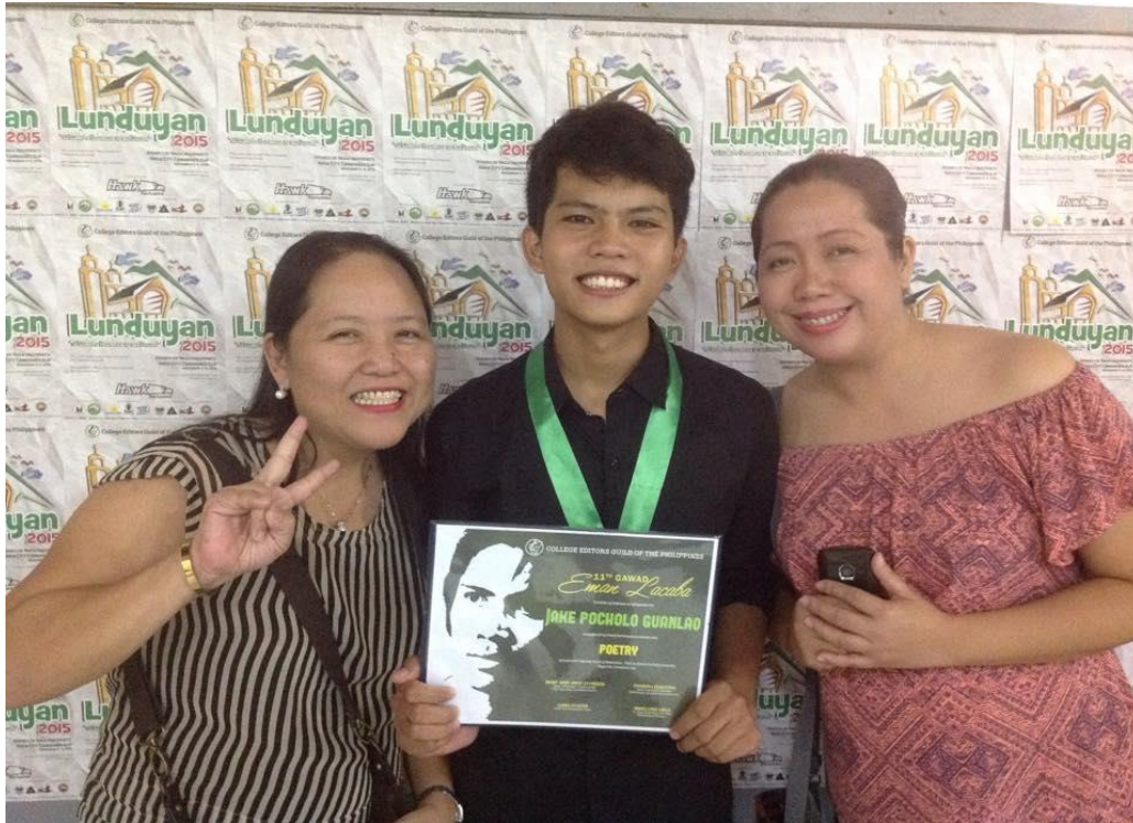
LUNDUYAN at the Ateneo de Naga last Noevember 5-9, 2015

ATSPAR in 16 th Regional Higher Education Press Conference at Villa Alfredos, City of San Fernando last December 13-15, 2016.