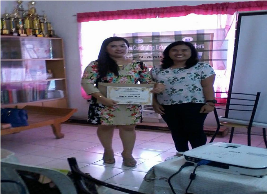
Bacolor Cluster In-Set Seminar-Workshop