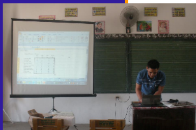
Seminar-Workshop in ICT for Teacher's Use