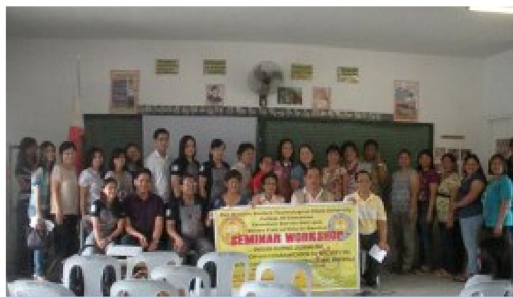
Opening Program of the two-day Seminar Workshop in English and Filipino Journalism, ICT for Teacher's Use, and Production and Utilization of Instructional Materials

An opening-program was held on November 9 which was attended by all the participants,