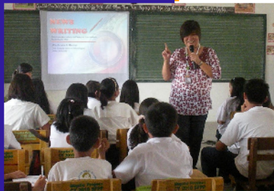
Seminar-Workshop in English Journalism