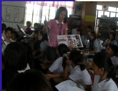
Seminar-Workshop in Filipino Journalism