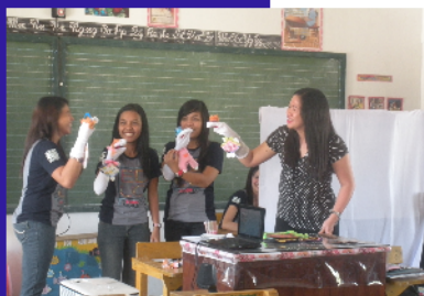
Seminar-Workshop in Production and Utilization of Instructional Materials