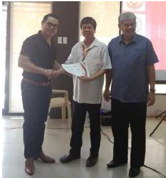
Awarding of Certificate of Appreciation to the Panel of Experts