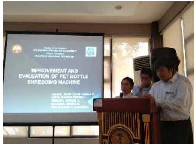
During the Presentation of Papers