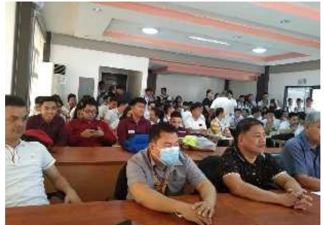
The colloquium was attended by selected BS Industrial Technology students, CCS Faculty and Advisers.