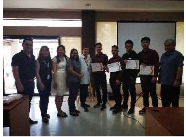
Awarding of Certificate of Recognition to the Student Researchers