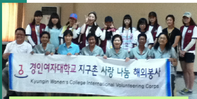
A photo opportunity during the closing program of the DHVTSU-Kyung-in Women's College.