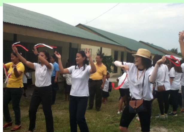
Tinajero Elementary School gives a warm welcome to DHVTSU and Kyung-In during the opening program of the community immersion. Korean students also joined the teachers in dancing.